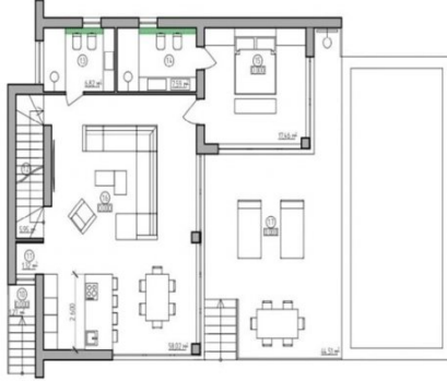
PLANTA BAJA 143 m 2