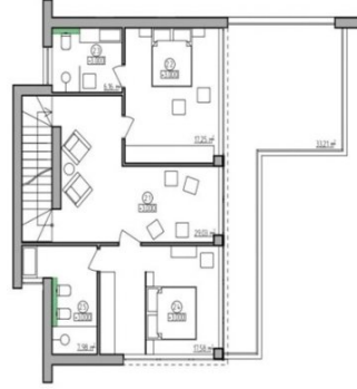
PLANTA PRIMERA 111 m 2