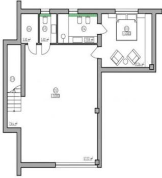
PLANTA SÓTANO 96 m 2