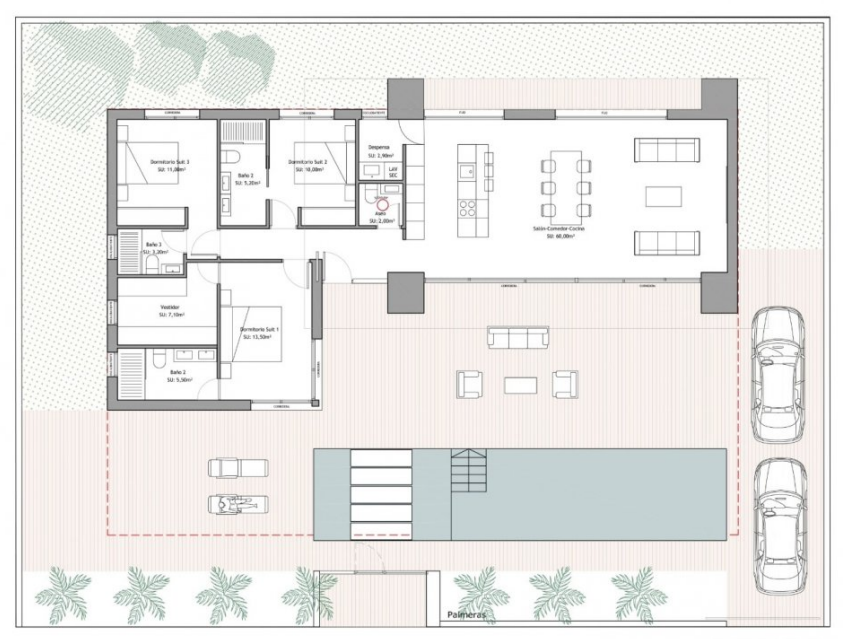
SUP. PARCELA: 530 m2 EDIFICABILDAD: 146,00 m2