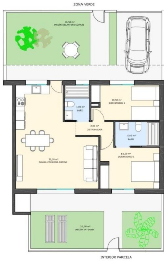
ESQUEMA PLANTA BAJA