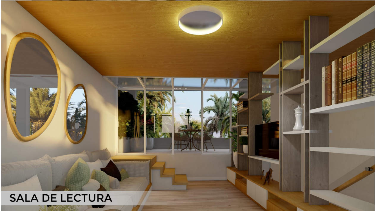
SALA DE LECTURA