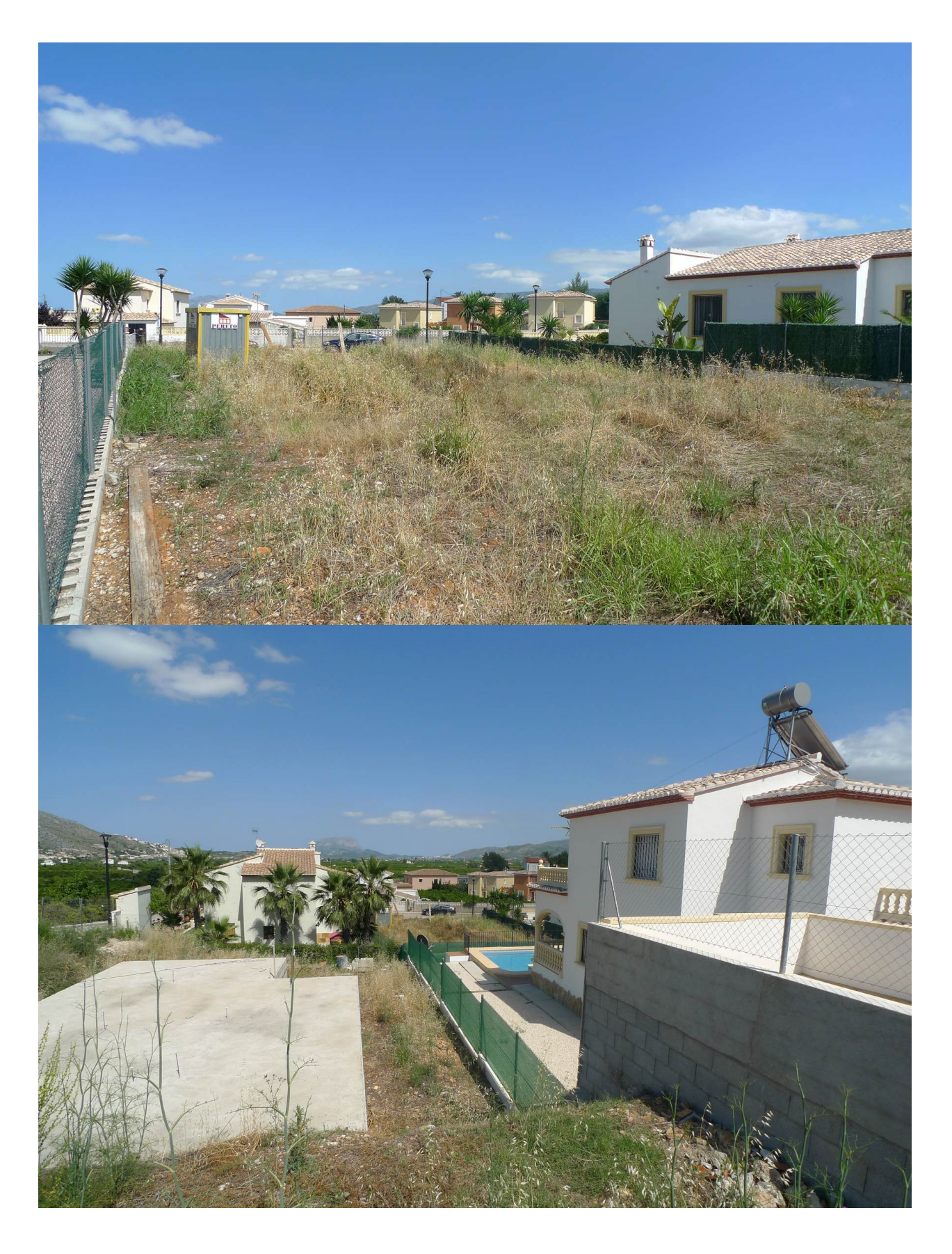
"OUR EXPERIENCE IS YOUR GUARANTEE"